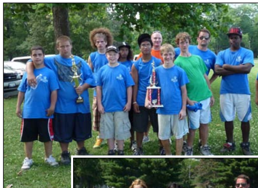
Our boys' team took second place overall.

B CHFS would like to congratulate the members of our boys and girls IIAA softball teams for their success at the 2011 state tournament! This year's tournament was held at Lincoln Park in Springfield, IL on Saturday, July 16. The BCH girl's team won first place after beating Kemmerer Village, of Assumption, IL 11-10 on a walk-off, inside the park home run. The boys took home second place after dropping the championship game to Salem Children's Home in Flanagan, IL.