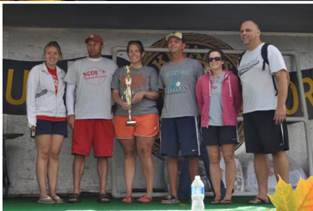
Pleasant Hill Baptist Church in Mt. Vernon captured their third consecutive volleyball title at this year's festival.