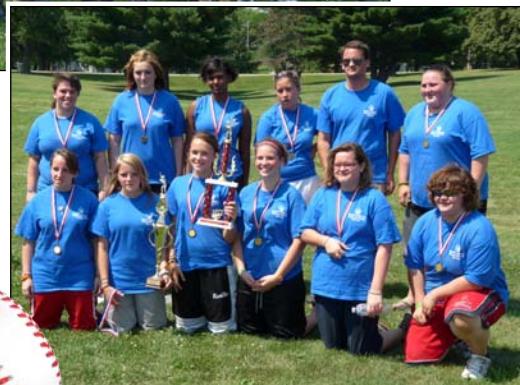
The winning BCHFS girls' team.